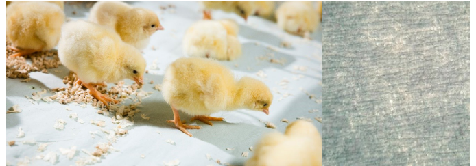
Figure 2: Day-old chicken stable on Intra Chickpaper and a microscope photo of Intra Chickpaper clearly showing the rougher surface.

Surfaces such as cardboard, plastic or newspaper should better not be used in the brooder. On these surfaces the chicks don't get sufficient grip. Furthermore they do not well absorb the first droppings of urine and manure, tend to get packed and mouldy as well.