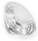
15°, 24°, 60° Lens GL-TR-LENS-14W-22W-15 GL-TR-LENS-14W-22W-24 GL-TR-LENS-14W-22W-60