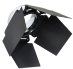
Barn Door TK-BD1-B TK-BD1-W

Lens can be changed with different beam angles.