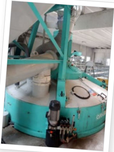
Whose your Mamma?.. This great big mixer gave birth to the 360 and 750 .