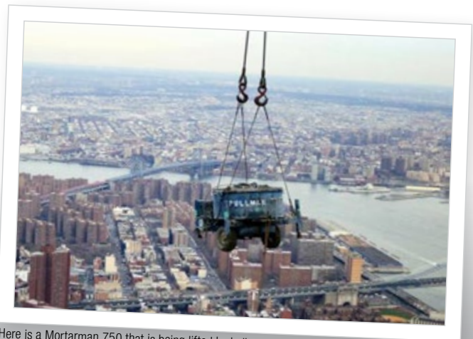
Here is a Mortarman 750 that is being lifted by helicopter to the top of the Freedom Tower in NYC. From the roof of the Tower a beautiful spire goes up and up, the Mortarman 750 mixed the specialty grout that holds the spire in place. - Thanks to Bill Drudy, RFI Construction Products, Farmingdale, NY.

Our electrical motors are supplied by Leeson, an industrial duty motor manufacturer located in Grafton, Wisconsin.