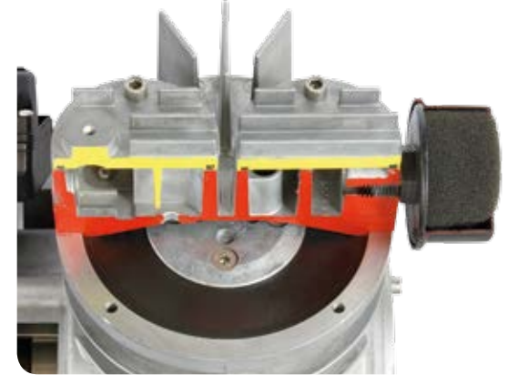
Air filter replacement is quick and easy.