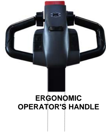
ERGONOMIC OPERATOR'S HANDLE