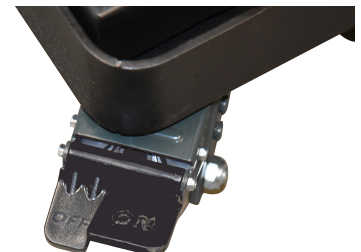
Rear locking swivel casters