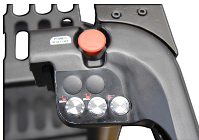
Right hand controls

The right-hand operator control pod features fingertip lift/lower buttons for the operator platform and a recessed emergency power disconnect. On the left-hand control pod, a cup holder, horn, and battery discharge indicator with hour meter are provided.