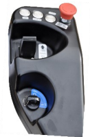
Travel, Lift, Lower, Key Switch and EPD Controls

Dual control for forks trailing operation stance includes hand sensor that automatically maintains a consistent steering orientation when active.