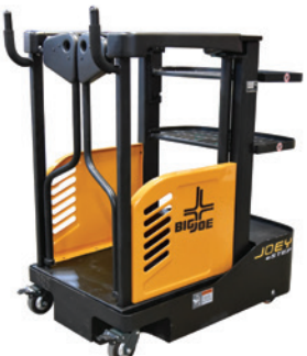
Joey eStep Semi-electric access vehicle 600 lb total vehicle capacity Lift heights up to 48"