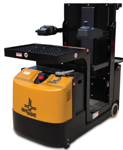
J1-126/J1-162/J1-192 Joey Task support vehicles 1,000 lb max. total vehicle capacity Lift heights up to 192" Optional towing of up to 2,500lbs