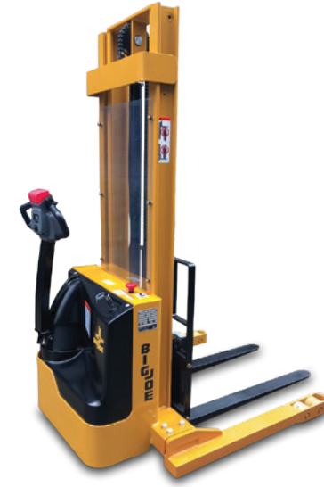
S30 3,000 lb capacity Compact walkie straddle stacker AC drive motor, offset tiller