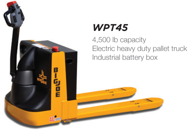
WPT45 4,500 lb capacity Electric heavy duty pallet truck Industrial battery box