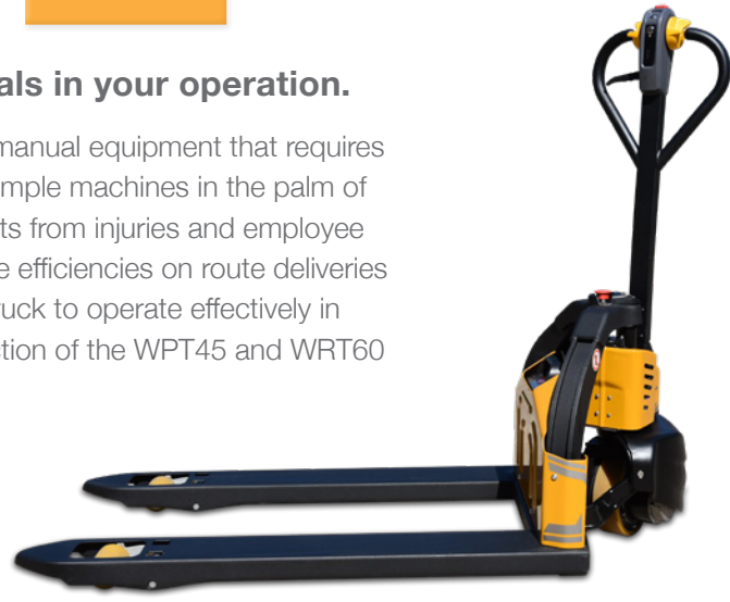
E25 2,500 lb capacity Electric pallet jack Easy Exchange lithium battery pack