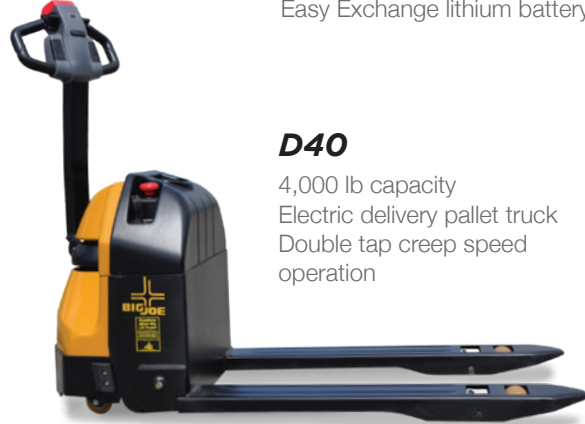
D40 4,000 lb capacity Electric delivery pallet truck Double tap creep speed operation