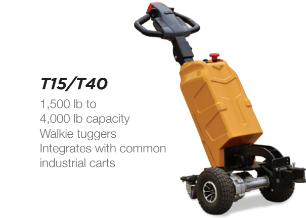
T15/T40 1,500 lb to 4,000 lb capacity Walkie tuggers Integrates with common industrial carts