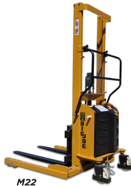
M22 2,200 lb capacity Semi-electric straddle stacker Fold down steer bar

Products like the M22, IBH, S22 and S30 can be used for basic warehousing in tight areas or as mobile work positioners to improve workplace ergonomics. Trucks like the PDS, CB22, CB33, PDC are a great way to supplement your fleet given their low operating cost, and can improve safety in work areas where high speed riders can pose a threat to personnel. Our PDSR30 is a popular hybrid vehicle that offers the best of both straddle and counterbalanced machines, while our V15, V18, and V20 three wheel forklifts deliver great driving characteristics and performance while keeping things simple. When you stack up all of the value that these Big Joe machines offer, it is easy to see that yeah... you could pay more, but you won't get a better truck.