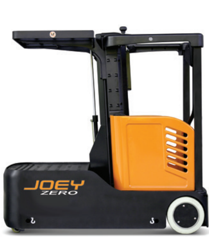
JO Joey Electric access vehicle 750 lb total vehicle capacity Lift heights up to 118" Powered load tray

The compact and capable Joey series of vehicles offer great alternatives to rolling ladders or larger equipment where elevation of personnel is required to complete a task such as order picking or overhead maintenance. Joey models J1-126, J1-162 and J1-192 can also tow carts weighing up to 2,500 lbs to feed packing stations or support manufacturing operations. The J2-72 low level order picker, J2-126 and J2-144 mid level order pickers offer forks forward operation in tune with changes being driven by ecommerce in the supply chain. The J0-118 Joey can help workers do a wide range of elevated tasks more safely while the Joey eStep is a safe alternative to low level ladders in the workplace.