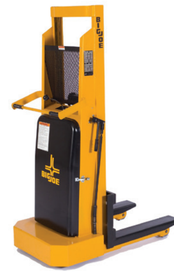
IBH 1,000 lb to 2,500 lb capacity Semi electric straddle stacker Heavy duty straddle & fork over models