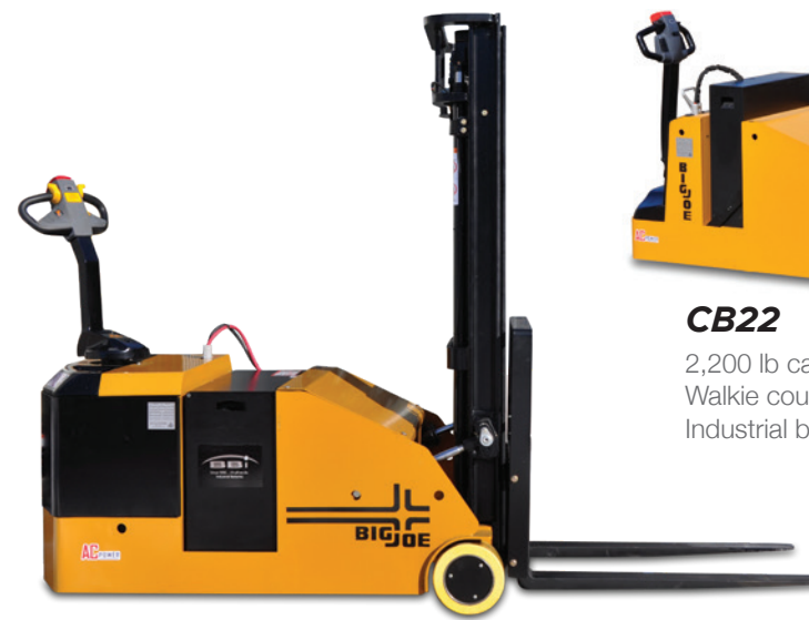
CB22 2,200 lb capacity Walkie counterbalanced stacker Industrial battery box, low mount tiller