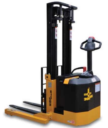
PDS30/PDS40 PDS30 / PDS40 3,000 lb to 4,000 lb capacity Walkie straddle stackers Industrial battery box, Top mounted tiller