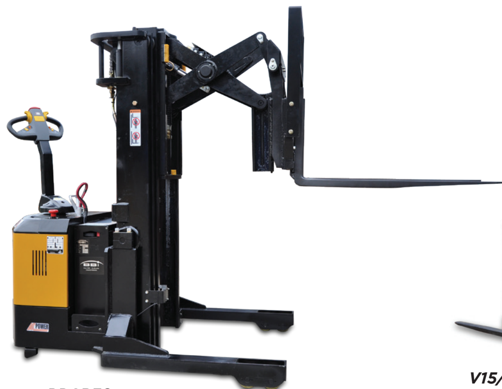
PDSR30 3,000 lb capacity Walkie reach stacker Pantograph mechanism, Power steering