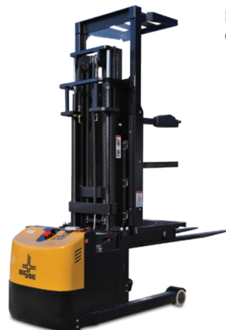
J2-126/J2-144 Joey Mid level order picker 2,000 lb max. total vehicle capacity Lift heights up to 144" Forks forward operation, pallet clamp