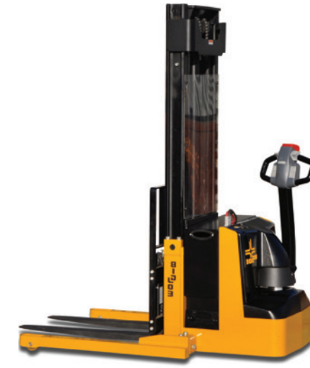
PDS25 2,500 lb capacity Walkie straddle stacker Industrial battery box, Low mount tiller