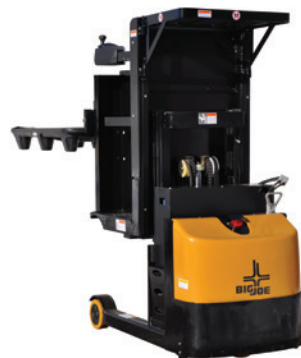
J2-72 Joey Low level order picker 2,000 lb total vehicle capacity Lift heights of 48" operator, 72" forks Forks forward operation, mini mast pallet clamp