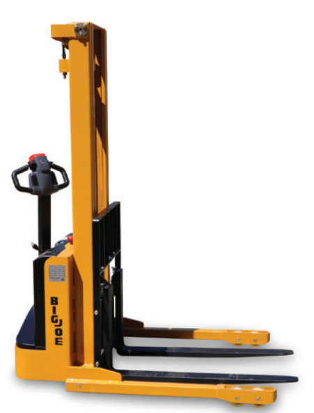
S22 2,200 lb capacity Compact walkie straddle stacker Permanent magnet drive motor, offset tiller Optional fork over configuration