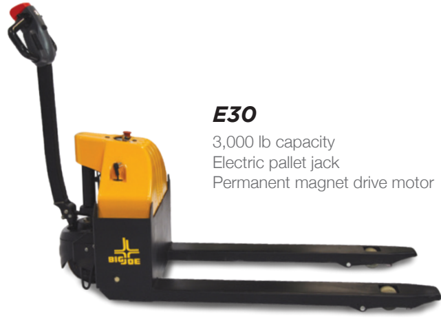
E30 3,000 lb capacity Electric pallet jack Permanent magnet drive motor

Products like the E25, E30, T15 and T40 can be used to replace manual equipment that requires physical labor to transport goods from point to point. By putting simple machines in the palm of your workers hands you can increase productivity and reduce costs from injuries and employee turn over while boosting morale. Products like the D40 can provide efficiencies on route deliveries due to the truck's small lightweight powerhead that enables the truck to operate effectively in trailers and retail store locations, while the simple rugged construction of the WPT45 and WRT60 can deliver low operating cost and high cycle performance.