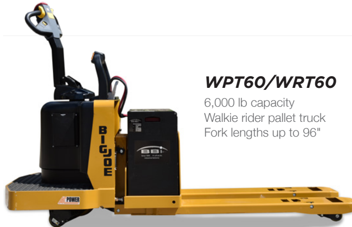
WPT60/WRT60 6,000 lb capacity Walkie rider pallet truck Fork lengths up to 96"