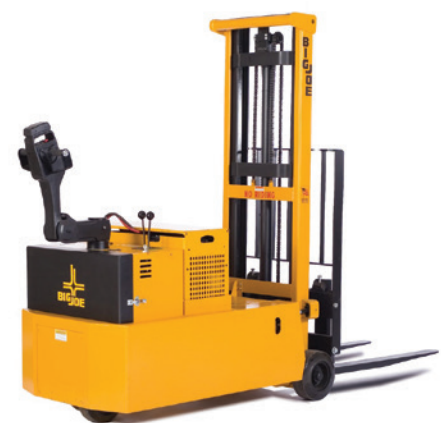
PDC25/PDC30/PDC40 2,500 lb to 4,000 lb capacity Walkie counterbalanced stacker Heavy duty construction, Industrial battery box