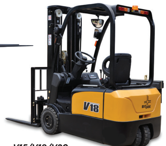
V15/V18/V20 2,800 lb to 4,000 lb capacity Electric three wheel forklifts Solid pneumatic tires, 48v, AC drive motors