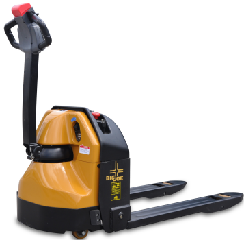
D40 electric pallet jack 4,000lb capacity