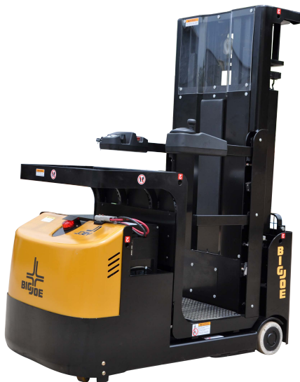
J1 Joey Task Support Vehicle 1,000lb capacity

The PDSR features 3,000lb capacity models with lift heights to 189". It combines the tight turning characteristics and low operating cost of a walkie straddle stacker with the flexibility of a counterbalanced truck through the use of a pantograph. This mechanism extends the loads being handled beyond the straddle legs to lift or lower products and can be retracted for compact turns. With the addition of power steering, sideshift, proportional hydraulics, and tilt, the PDSR delivers exceptional versatility and easy intuitive control.