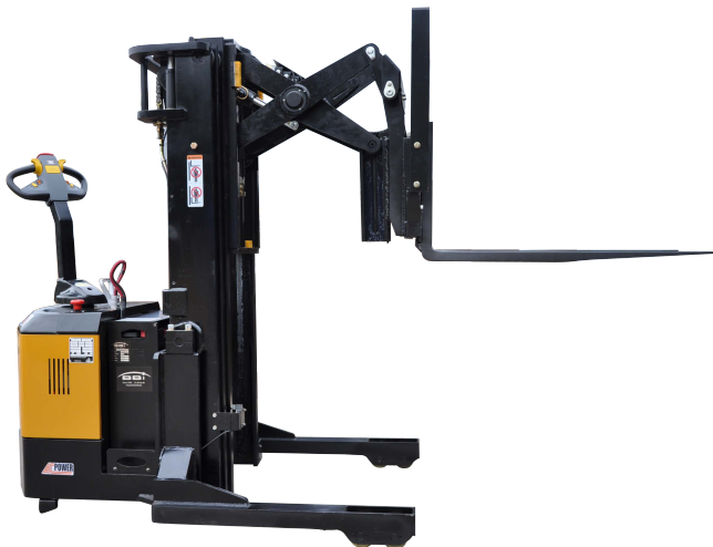
PDSR Reach Stacker 3,000lb capacity

The D40 features a 4,000lb capacity, high efficiency brushless AC drive motor and two 12V 85AH maintenance free batteries for 4 hours of continuous operation. The integral 110V smart charger allows for fast, hassle-free charging from any wall outlet. Travel, lift, and lower functions are located in the ergonomic operator handle. All operator controls are accessible without having to lift the hand from the handle.