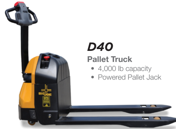
D40 Pallet Truck • 4,000 lb capacity • Powered Pallet Jack