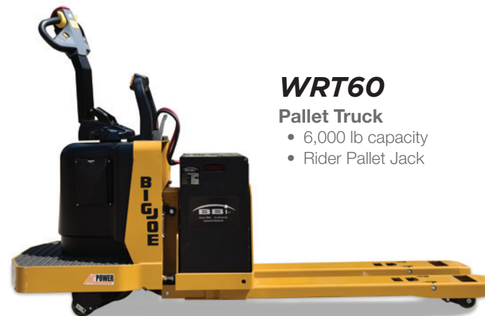
WRT60 Pallet Truck • 6,000 lb capacity • Rider Pallet Jack

For more information, contact your local Big Joe Dealer, or visit www.bigjoeforklifts.com