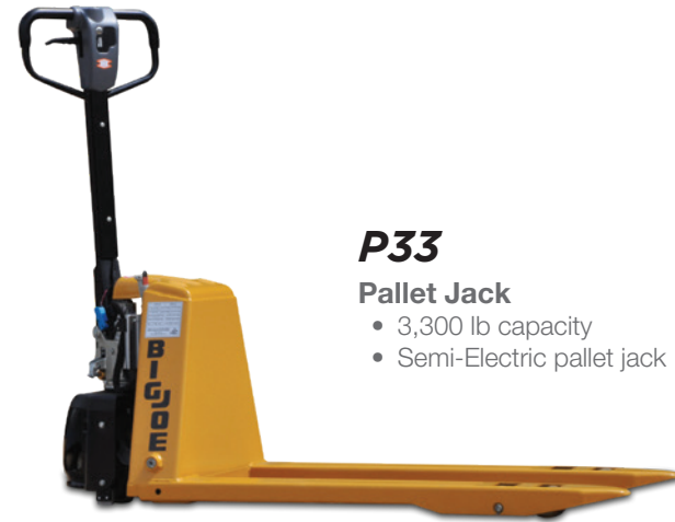
P33 Pallet Jack • 3,300 lb capacity • Semi-Electric pallet jack

products is designed to increase productivity and reduce the risk of employee injuries.