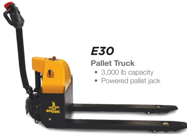
E30 Pallet Truck • 3,000 lb capacity • Powered pallet jack