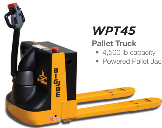
WPT45 Pallet Truck • 4,500 lb capacity • Powered Pallet Jack