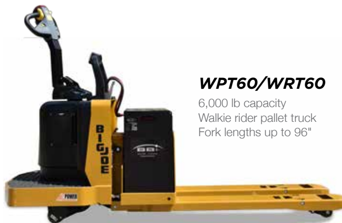
WPT60/WRT60 6,000 lb capacity Walkie rider pallet truck Fork lengths up to 96"