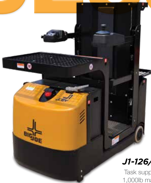
J1-126/J1-162/J1-192 Joey Task support vehicles 1,000lb maximum total vehicle capacity Lift heights up to 192" Optional towing of up to 2,500lbs

The Joey series of vehicles offer a great alternative to rolling ladders or larger equipment where elevation of personnel is required to complete a task. Compact and capable Joey series vehicles are highly maneuverable, intuitive to operate and an excellent equipment choice in support of general overhead maintenance, inventory or order picking duties. Vehicles like the J1-126, J1-162, and J1-192 can be combined with a cart to feed to pack stations or for manufacturing support, while the J2-72 and J2-126 will have you stop thinking backwards about forks forward operation given changes being driven by ecommerce in the supply chain.