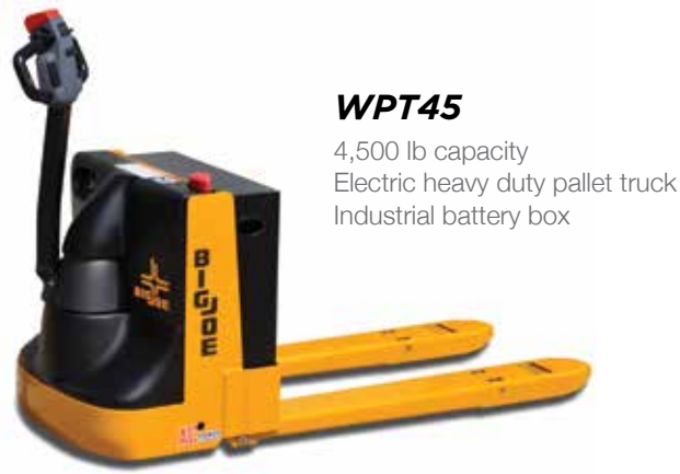
WPT45 4,500 lb capacity Electric heavy duty pallet truck Industrial battery box