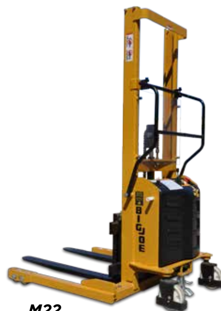
M22 2,200lb capacity Semi-electric straddle stacker Fold down steer bar

Products like the M22, IBH, S22 and S30 can be used for basic warehousing in tight areas or as mobile work positioners to improve workplace ergonomics. Trucks like the PDS, CB22, CB33, PDC are a great way to supplement your fleet given their low operating cost, and can improve safety in work areas where high speed riders may pose a threat to personnel. Our PDSR30 is a popular hybrid vehicle that offers the best of both straddle and counterbalanced machines, while our V15, V18, and V20 three wheel forklifts deliver great driving characteristics and performance while keeping things simple. When you stack up all of the value that these Big Joe machines offer, it is easy to see that yeah... you could pay more, but you won't get a better truck.