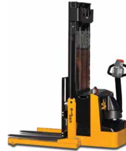
PDS25 2,500 lb capacity Walkie straddle stacker Industrial battery box, Low mount tiller