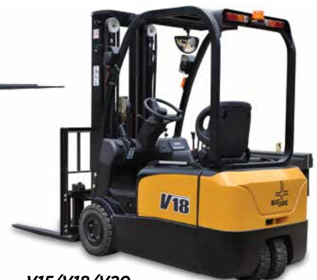
V15/V18/V20 2,800 lb to 4,000 lb capacity Electric three wheel forklifts Solid pneumatic tires, 48v, AC drive motors