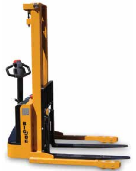
S22 2,200 lb capacity Compact walkie straddle stacker Permanent magnet drive motor, offset tiller Optional fork over configuration