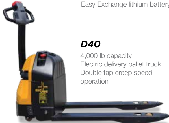
D40 4,000 lb capacity Electric delivery pallet truck Double tap creep speed operation