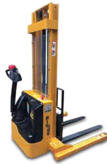
S30 3,000 lb capacity Compact walkie straddle stacker AC drive motor, offset tiller