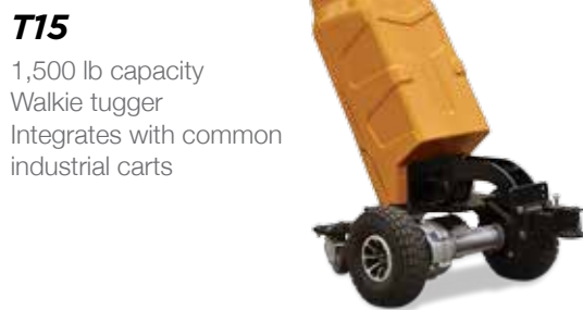
T15 1,500 lb capacity Walkie tugger Integrates with common industrial carts