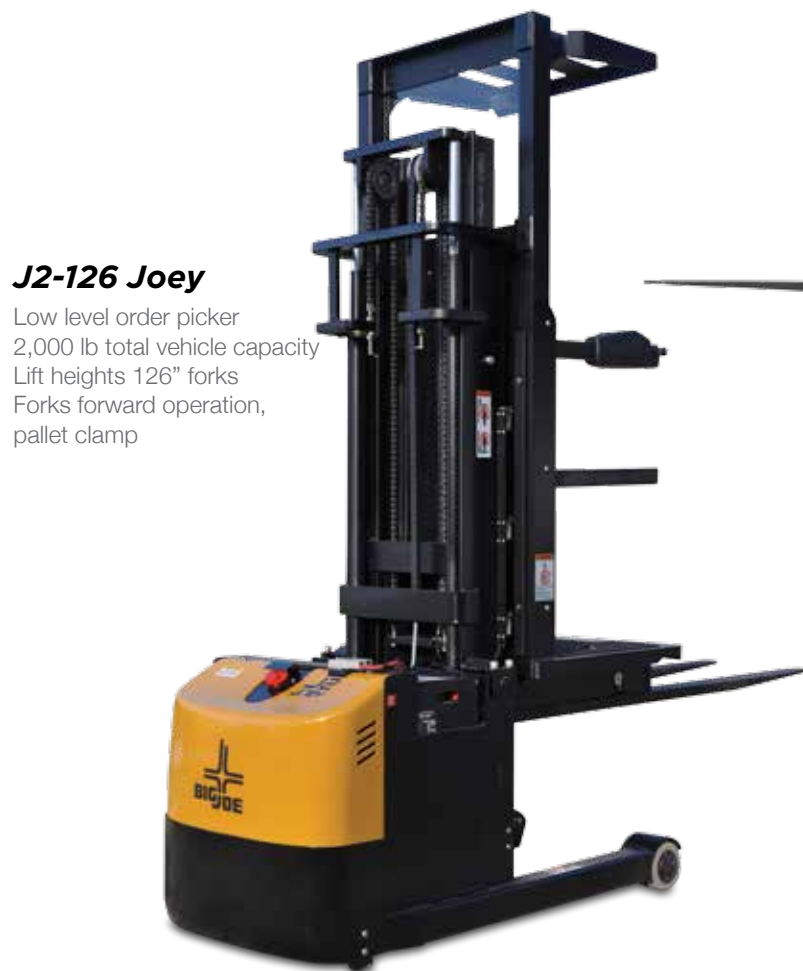
J2-126 Joey Low level order picker 2,000 lb total vehicle capacity Lift heights 126" forks Forks forward operation, pallet clamp