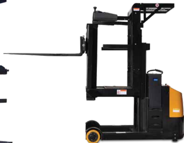
J2-72 Joey Low level order picker 2,000 lb total vehicle capacity Lift heights of 48" operator, 72" forks Forks forward operation, mini mast