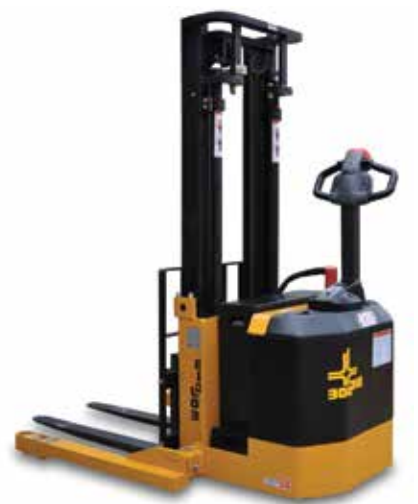
PDS30/PDS40 PDS30 / PDS40 3,000 lb to 4,000lb capacity Walkie straddle stackers Industrial battery box, Top mounted tiller