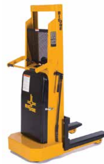
IBH 1,000lb to 2,500lb capacity Semi electric straddle stacker Heavy duty straddle & fork over models