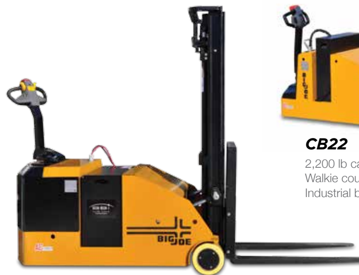
CB22 2,200 lb capacity Walkie counterbalanced stacker Industrial battery box, low mount tiller