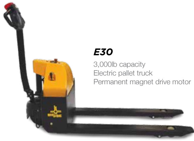
E30 3,000lb capacity Electric pallet truck Permanent magnet drive motor

Products like the E25, E30 and T15 can be used to replace manual equipment that requires physical labor to transport goods from point to point. By putting simple machines in the palm of your workers hands you can increase productivity and reduce costs from injuries and employee turn over while boosting morale. Products like the D40 can provide efficiencies on route deliveries due to the truck's small lightweight powerhead that enables the truck to operate effectively in trailers and retail store locations, while the simple rugged construction of the WPT45 and WRT60 can deliver low operating cost and high cycle performance.