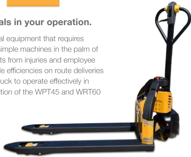
E25 2,500lb capacity Electric pallet jack Easy Exchange lithium battery pack