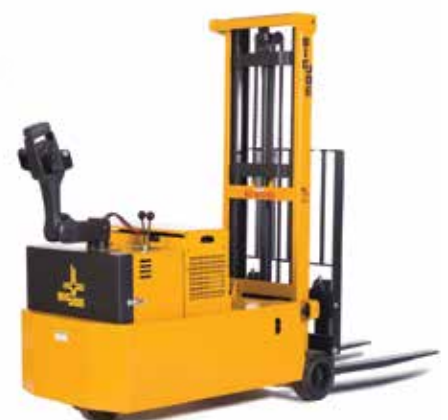
PDC25/PDC30/PDC40 2,500 lb to 4,000 lb capacity Walkie counterbalanced stacker Heavy duty construction, Industrial battery box