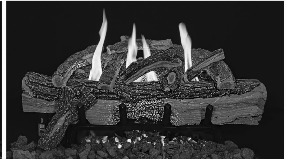
30" Split Oak Gas Logs

All Vent-Free log set styles available in 3 sizes: 18", 24" or 30"