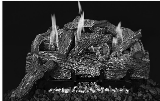
24" Red Oak Gas Logs