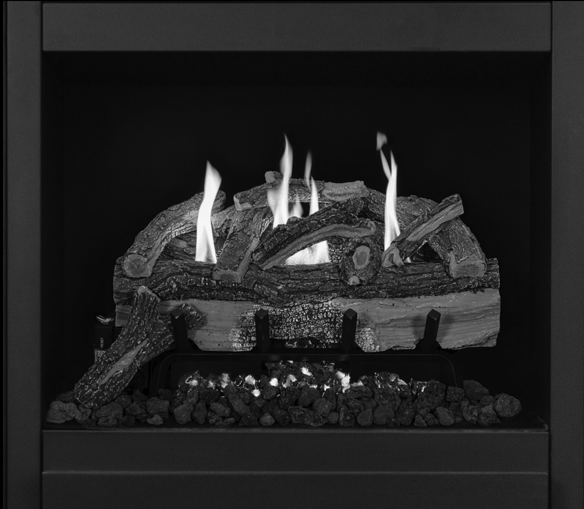
Vent Free Split Oak 24"