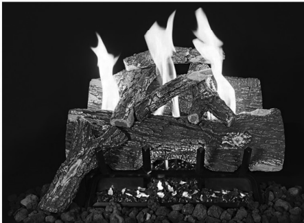
18" Weathered Oak Gas Logs