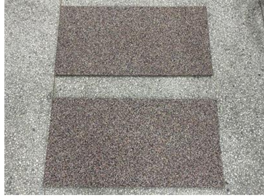
Received Sample 1 (back view)