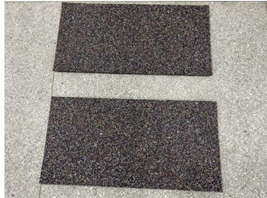
Received Sample 2 (back view)