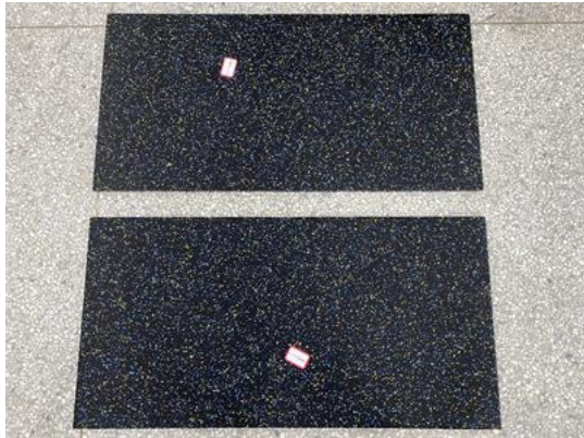
Received Sample 2 (front view)