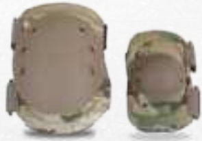
DKP-MC/DEP-MC (MultiCam® Camo)

Minimums & lead times apply on all "Made to Order" items and vary by style. Please inquire for specific quotes.