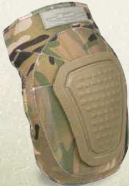
DNKP-M (MultiCam® Camo)