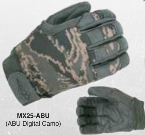
MX25-ABU (ABU Digital Camo)