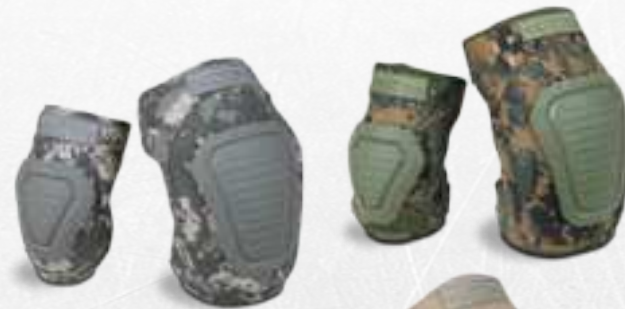
DNKP-DW/DNEP-DW (Digital Woodland Camo)