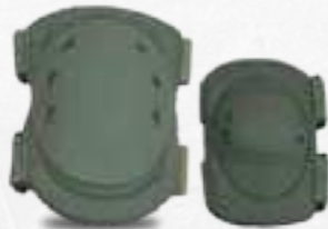
DKP-OD/DEP-OD (OD Green)