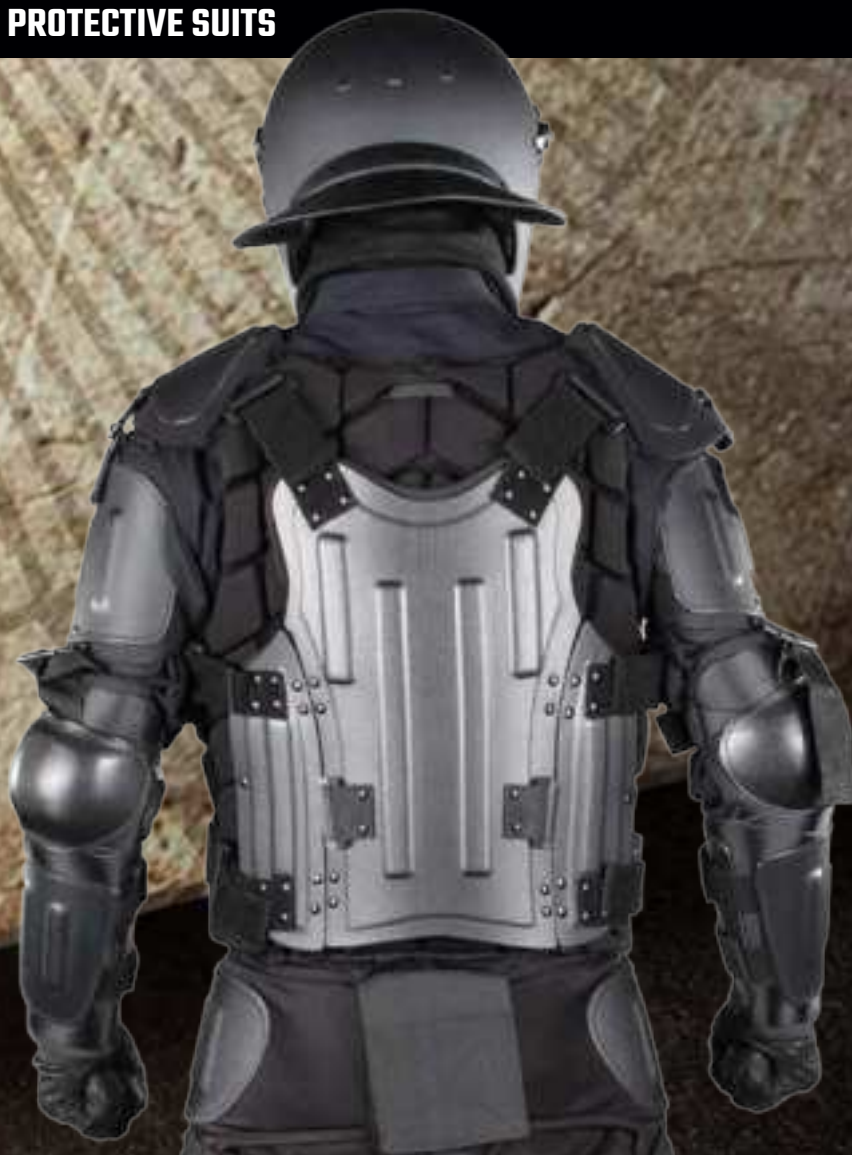
Supreme Upper Body and Shoulder Protection