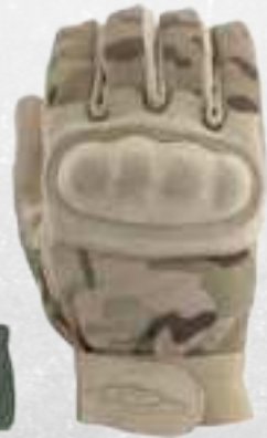
MX25-MH (MultiCam® Camo)