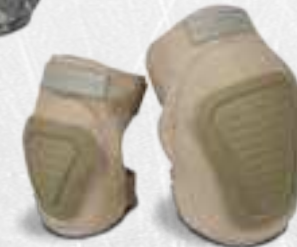
DNKP-T/DNEP-T (Coyote Tan)