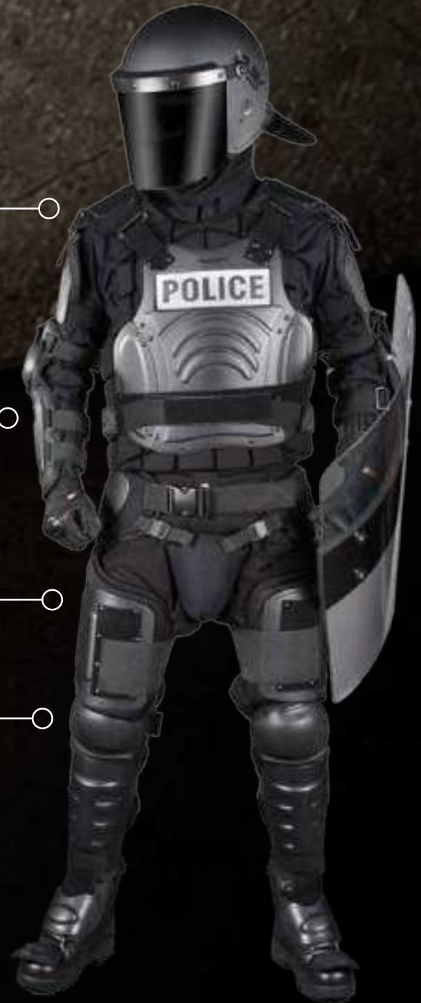
Adjustable Knee/Shin Guards