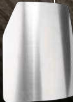
Aluminum Stab Plate Insert