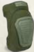
DNKP-OD (OD Green)