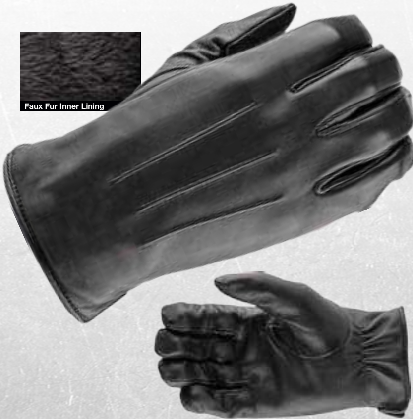
Faux Fur Inner Lining