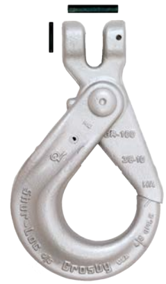
S-1317 Clevis Hook