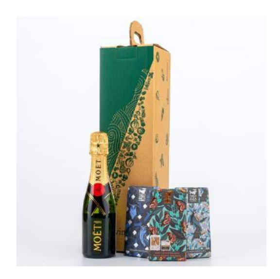
Champagne & Premium Chocolate Set