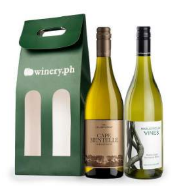
Deluxe Whites Pair Gift