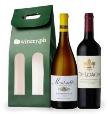
Deluxe Red & White Pair Gift