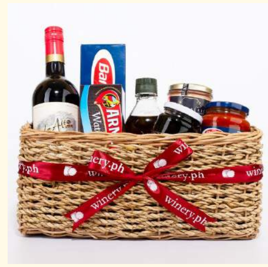
Select Gift Hamper in Gift Basket