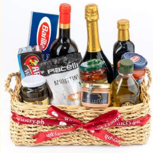
Premium Gift Hamper in Shipper Box