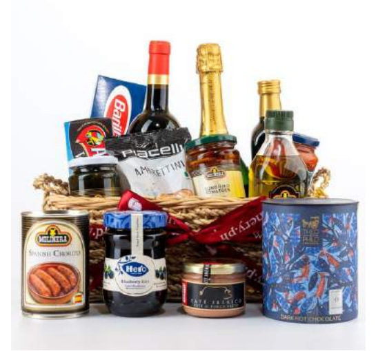
Luxury Gift Hamper in Shipper Box