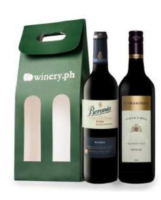
Deluxe Reds Pair Gift