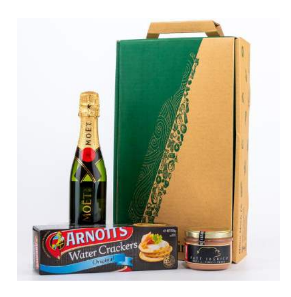
Champagne & Pâté Gift Set

There's no better way to spoil yourself or someone special than with some bubbly and creamy pâté. This elevated pair will bring a touch of luxury to your home.