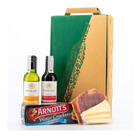
Wine, Jamon & Cheese e-Numan Set

Sample a little bit of everything on your next e-Numan night with this red and white set. Throw in some gourmet snacks and you're due in for an excellent session.