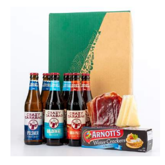
Beer & Jamon e-Numan Set

Treat yourself to this beer and tapas set, perfect for those nights (or days) when one beer isn't enough.