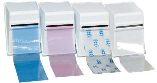
Dispenser not included. See dispenser Ref# below.