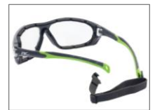
Detachable, adjustable strap for security