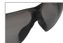
Integrated comfortable nose bridge