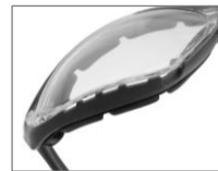
Vent design and anti-fog and anti-static polycarbonate lens