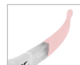
Soft rubber temple tips