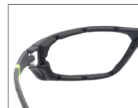
Foam insulation for comfort and protection