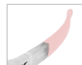
Soft rubber temple tips