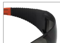
Short temples for secure & broader facial fit