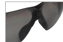
Integrated comfortable nose bridge