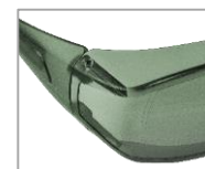
Fully integrated top, bottom & side shields protection