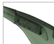
Adjustable temples to fit broader facial