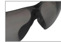
Integrated comfortable nose bridge