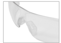
Integrated comfortable nose bridge