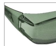
Fully integrated top, bottom & side shields protection