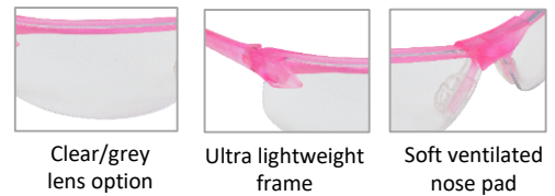
Clear/grey lens option