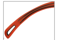
Soft temple tips