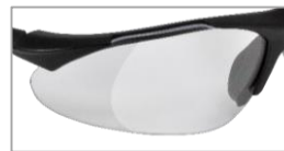
Full 50mm diameter magnifying lens