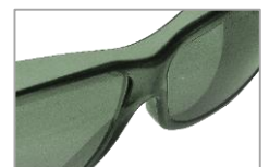
Built-in comfortable nose bridge

For more information, visit palmerohealth.com , call 800.344.6424 or email customerservice@palmerohealth.com .