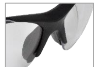
Integrated comfortable nose bridge