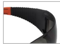
Short temples for secure & broader facial fit