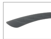
Soft rubber temple tips