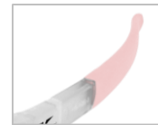
Soft rubber temple tips