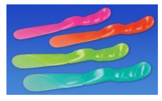
Ref # 1520s

For more information, visit palmerohealth.com, call 800.344.6424 or email customerservice@palmerohealth.com.