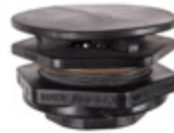
Smooth Flow Water Fitting