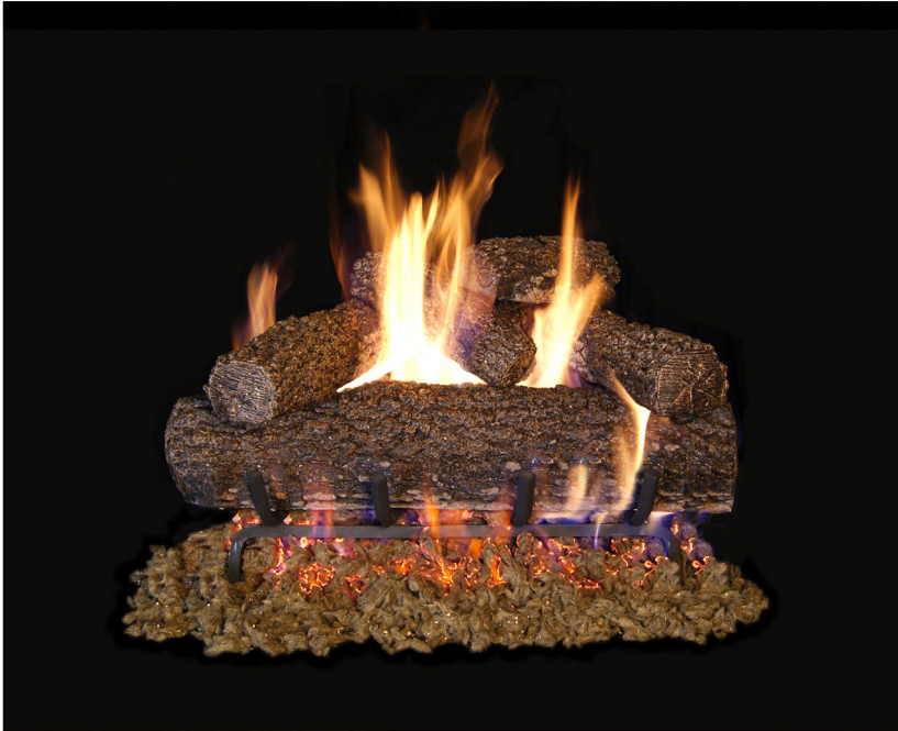
18" CANYON OAK, 68-CE

Note: Shipped for use with natural gas - specify if for propane gas by adding a "P" to the model number. Safety Pilot kit included with propane set. ALL REAL FYRE™ valves, remotes and accessories are compatible with the FYRESIDE Builder series.