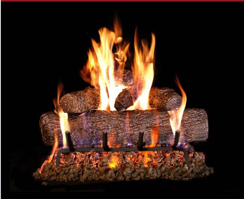
24" LIVE OAK, 64-YE