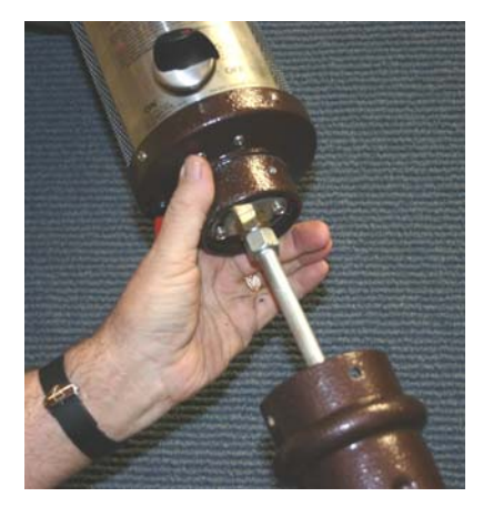
HEAD WITH FEED LINE TO POST

Either end of the feed line can be screwed into the heater head. Now insert the feed line with 3/8" flared fitting into the base of the heater head. Do not use any Teflon tape or other sealant on this or any other brass-to-brass connection. Brass to brass will self-seal. Securely tighten the connection using two wrenches in a clock-wise direction. Do not over-tighten.