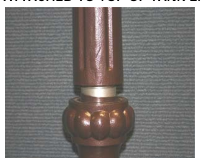
ALUMINUM POST TO SOCKET

Step 4 Carefully thread the cast aluminum post assembly onto the socket assembly that you have just attached to the cylinder enclosure, Start the threading process carefully and be sure not to cross-thread. Tighten securely until the post touches the top of the tank enclosure. If you have