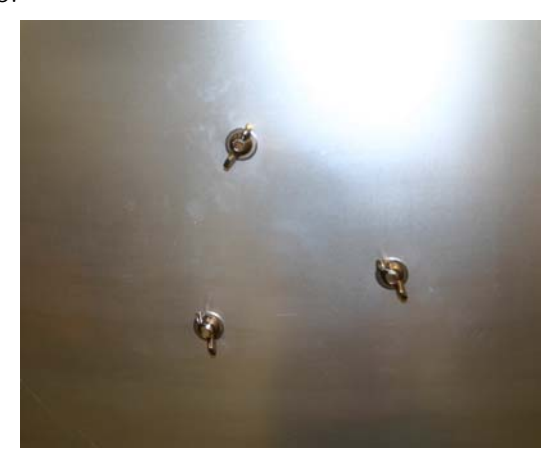
WING NUTS TO SECURE REFLECTOR

Step 9 Attach rubber protective ring to bottom of base.