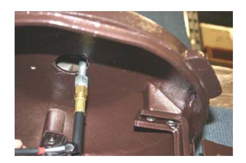
LP HOSE/REG TO FEEDLINE

The 3/8" feed line flared fitting will be visible inside the top of the cylinder enclosure. Now attach the hose and regulator to the feed line and securely tighten fittings with a wrench in a clockwise direction. No sealant is required.