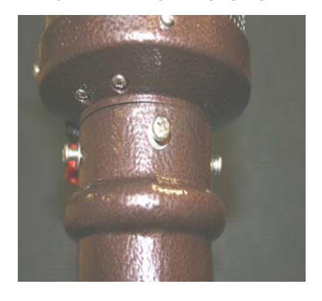
PHILIPS HEAD SCREWS SECURING HEAD TO ALUMINUM POST