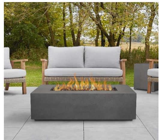
Available in Weathered Slate (C9811LP-WSLT)