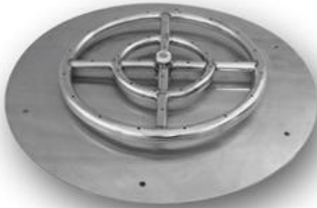
— Burner Assy.