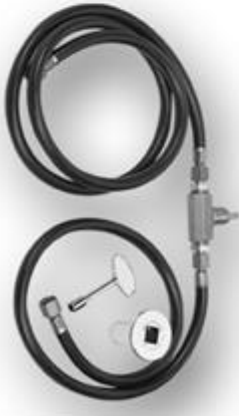
— Exit Gas Hose (To Air Mixer if Propane)