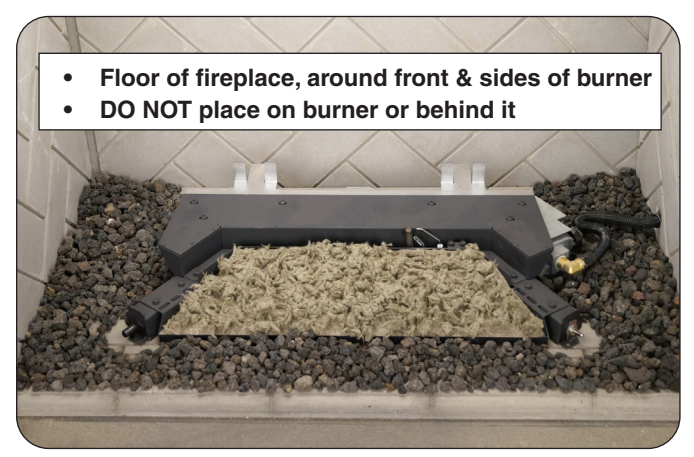
Fig. 2-2 Place lava media