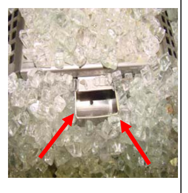
DO NOT COVER PILOT OPENING!