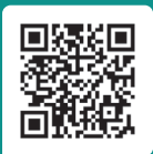
HexPave installation video

You can use the HEXpave on very slight inclines up to 5 degrees, and if so, must be anchored down. This is primarily for walking path areas and should not be driven on in an incline installation.