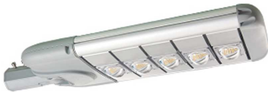
Strasse 150 Roadway Lighting