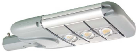
Strasse 90 Roadway Lighting