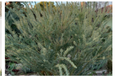
ACACIA CULTRIFORMIS 'Knifeleaf'