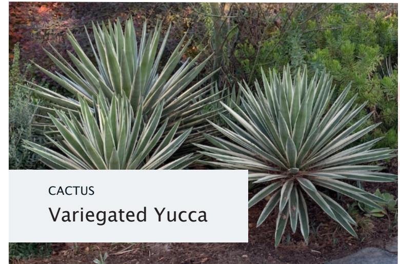
CACTUS Variegated Yucca