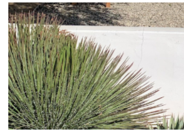
DASILIRION Desert Spoon

A colorful ensemble of fatty leaves saddles up to the sharp angles and variegated foliage of big cacti & acacias. The smaller creeping succulents create color at your feet. A heat friendly fruit tree (Pomegranate or Fig) adds juiciness to the ensemble.