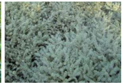
WESTRINGIA 'GREY BOX' Aus. Rosemary