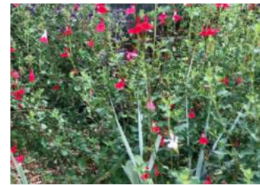
SALVIA 'HOT LIPS' Autumn Sage

This perfect pairing of silver and gold shines in fall when Deer grasses bloom beside Westringia 'grey box' hedging. Big yellow bells (Tecoma) & winter-berried Toyon give seasonal interest while cute and vibrant autumn sages replace traditional rose-lined walkways.