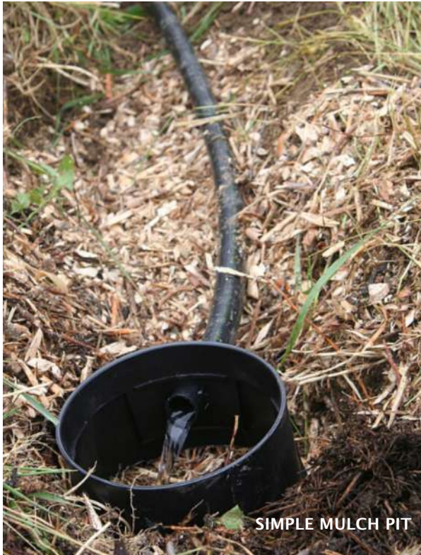
SIMPLE MULCH PIT

The average washing machine (for a 3 person house hold) cranks out 50-100 gallons a week of laundry water. Most laundry soaps are compatible with this system but avoid bleach.