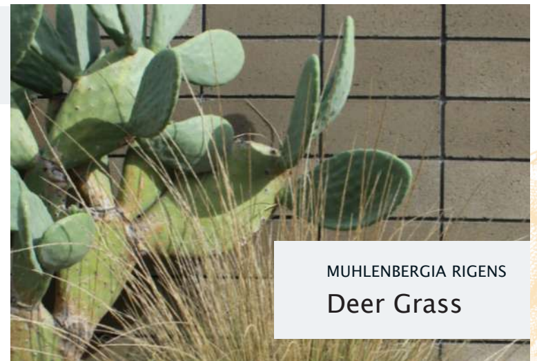
MUHLENBERGIA RIGENS Deer Grass

Deer grass shows off in this fall-fresh design. Part shade tolerant & low-water a winter trim or heavy rake out resets it for spring green in the new year. Most water-savvy of ornamental grasses, it even works great in shade (oak friendly!). For shade yards, substitute Prickly Pear with Blue Agave and Autumn sage with Salvia Spatheca.