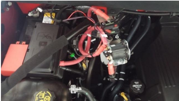
Typical GM Installation on Passenger Side of Engine Compartment

Install Circuit Breaker and Solenoid on Bracket as Shown. If Bracket Cannot be Used Choose a Location Where Circuit Breaker and Solenoid Will Be Protected From Being Damaged or Terminals Contacting Parts of Vehicle.