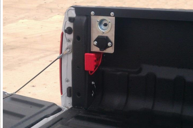
Typical Switch Plate Installation