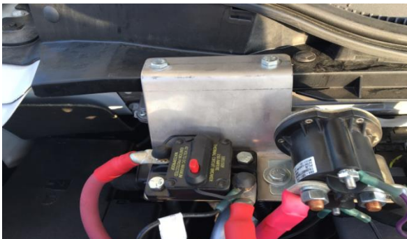
Typical Ford Installation on Passenger Side of Engine Compartment 2017