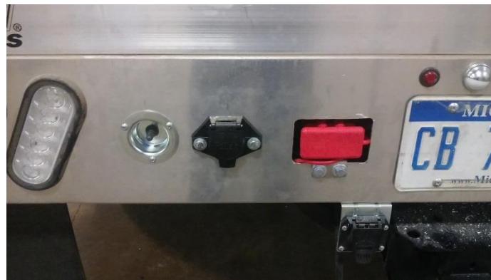
Typical Flatbed Installation