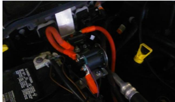
Typical Ford Installation on Passenger Side of Engine Compartment 2016 and Prior