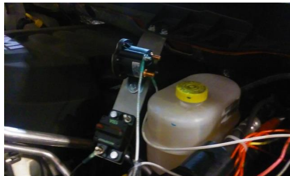
Typical Dodge Installation on Driver Side of Engine Compartment