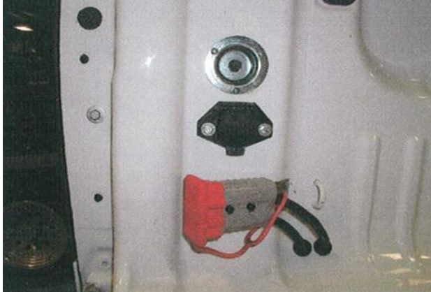
Typical In Box Wall Installation

Install Remote Switch and Plugs on Drivers Side, Inside of Box, At Rear.