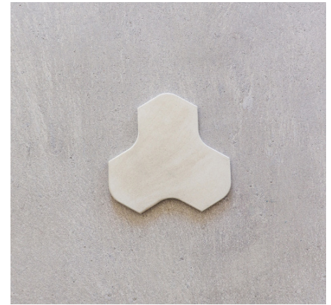
Silk finish: Luna Limesite is subject to variation in hue shade & texture. Refer to this image as an indication of the appearance & colour tone only