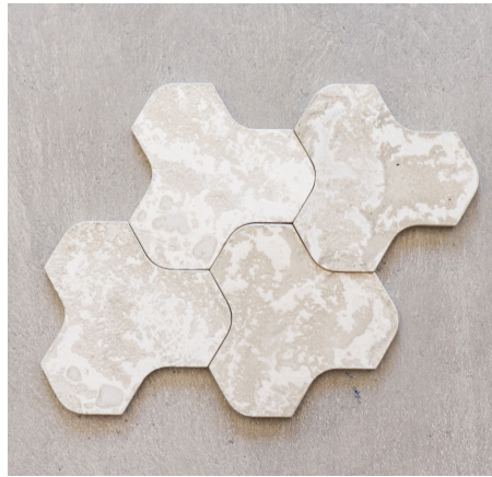
Dimensions finish: Luna