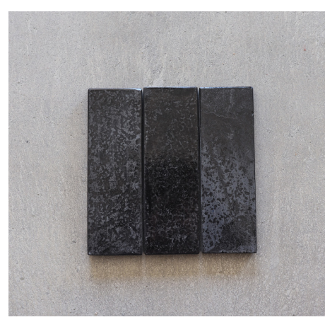
Dimensions finish: Lowveld Coal Limesite is subject to variation in hue shade & texture. Refer to this image as an indication of the appearance & colour tone only

Line Drawing (mm) Variation in size can be expected