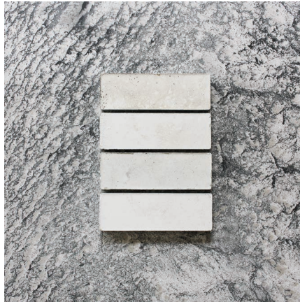
*Mini Subway Wall Tile in Wolkwhite (P4)