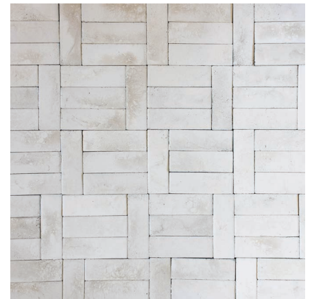
*Mini Subway Floor Tile in Wolkwhite (P4)