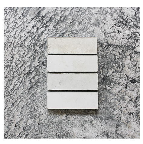
Limesite is subject to variation in hue shade & texture. Refer to this image as an indication of the appearance & colour tone only