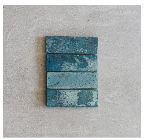
Dimensions finish: Ballito