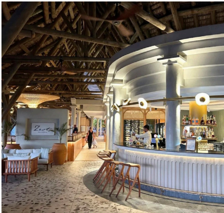
Limesite is subject to variation in hue shade & texture. Refer to this image as an indication of the appearance & colour tone only