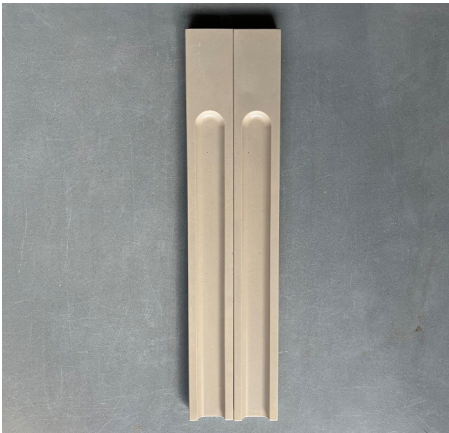
Saint ,Silk Finish