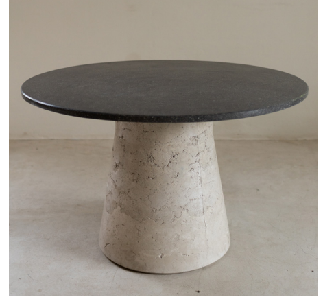
Rotunda Round Table