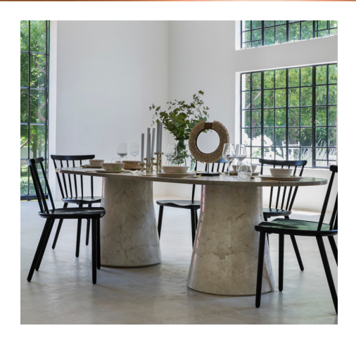
Rotunda Oblong Table