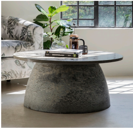
Rotunda Coffee Table