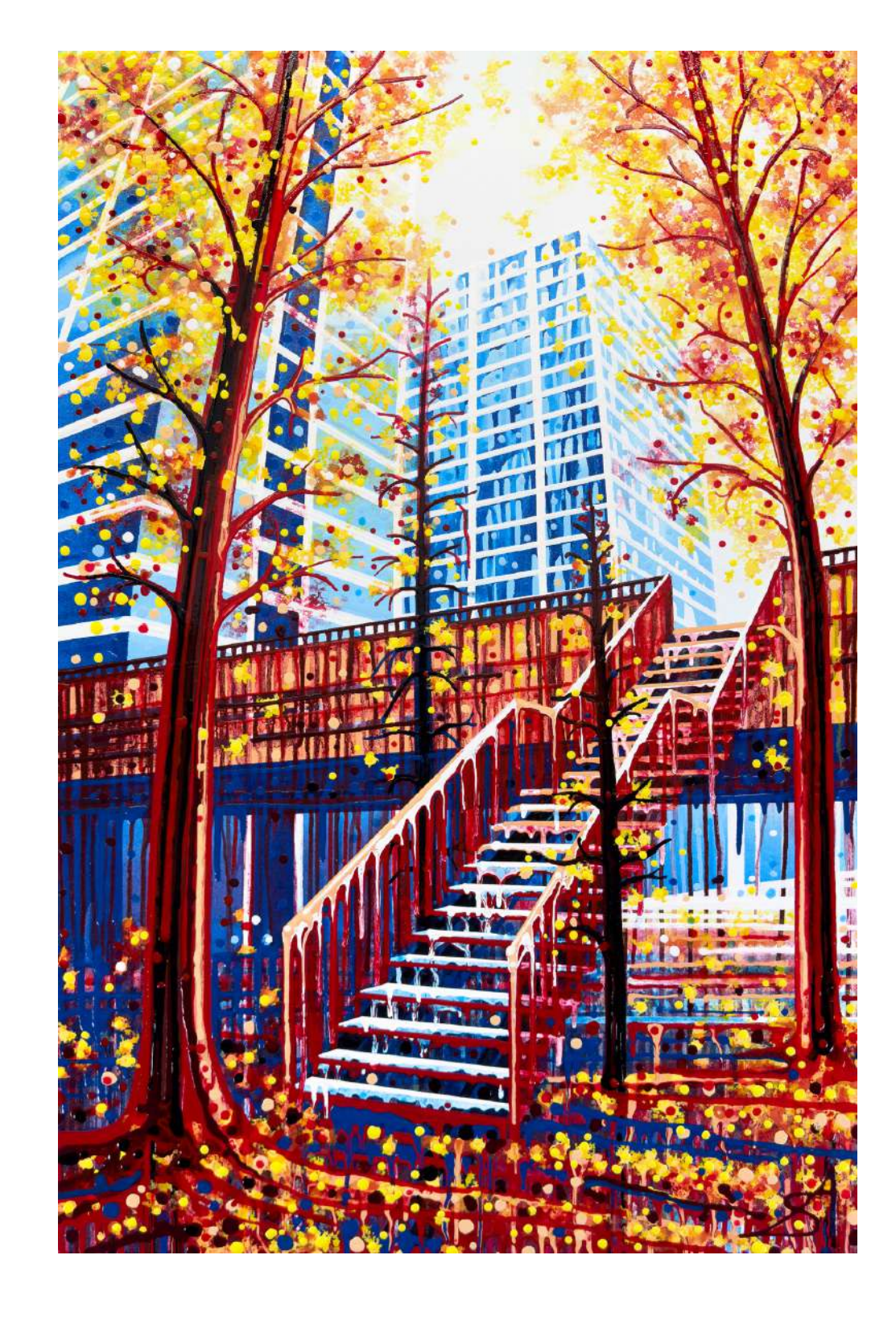
Ups and Downs (Chicago + California)