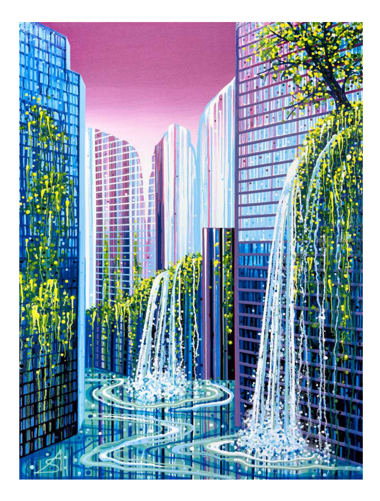
Lagoon Falls (Colorado + Toronto)