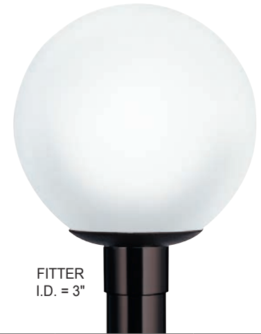
FITTER I.D. = 3"

ADD MG FOR MOGUL BASE SEE PAGE 46 FOR HIGH WATTAGE LIGHT COMMERCIAL MODELS