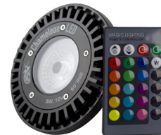
12V LED lamp included RGB models (R) include remote