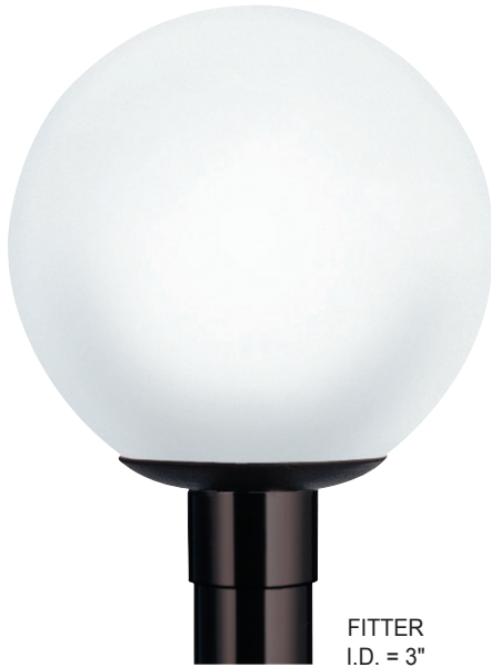
FITTER I.D. = 3"