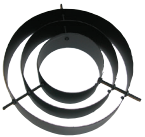
TDB3IL Directional Louver