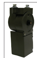
2AFPC with integral button photocell.