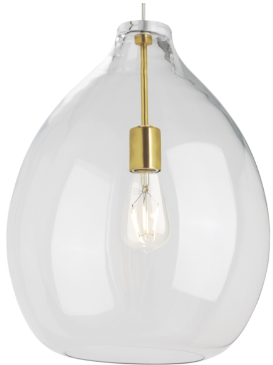
Clear/Natural Brass Incandescent