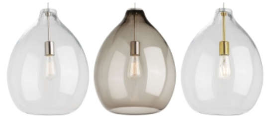
Clear/Satin Nickel Incandescent

Rated for (1) 60 watt max, E26 medium base lamp (Lamp Not Included). LED includes (1) 120 volt 3.5 watt, 250 delivered lumen, 2700K, medium base LED vintage squirrel cage lamp. Dimmable with most LED compatible ELV and TRIAC dimmers. Black ships with six feet of field-cuttable black cloth cord. Satin Nickel ships with six feet of field-cuttable cable.