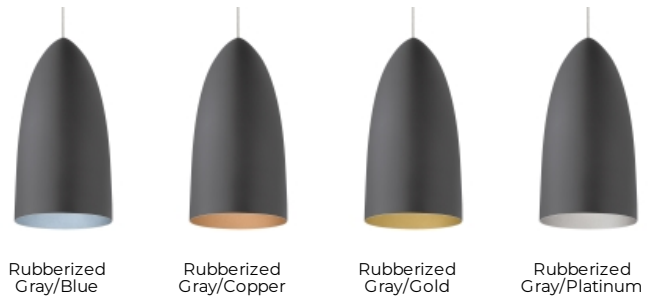
To view all available finish options, please visit techlighting.com

Rated for (1) 50w max, Halogen MR16 lamp or LED 6.5 watt low-voltage GU5.3 base 90 CRI 3000K LED MR16 lamp and 6' of field-cuttable suspension cable. For use with 24 volt transformer, add suffix '-24' to item number. (LED lamp option is not compatible with 24 volt transformers).